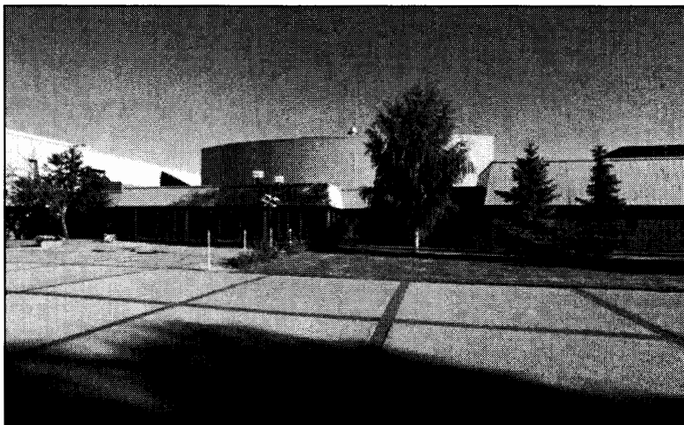
Medicine Hat College, Medicine Hat, Alberta, home of the 1998 C 3 conference

Canadian Airlines International and their regional partners have been selected as the Official Carrier for the Conference. Canadian Airlines Conventionair Reservations Office will guarantee you